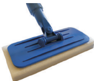
Trowel on the stick