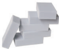
„Magic sponge” without a strap Size: 10,6x6,2x2,8 [cm]