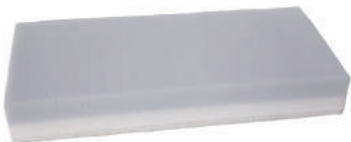
Hand pad Size: 11x25,5 [cm]