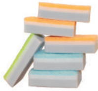
„Magic sponge” with a Velcro strap Size: 10,6x6,2x2,8 [cm]